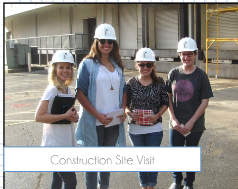
Construction Site Visit