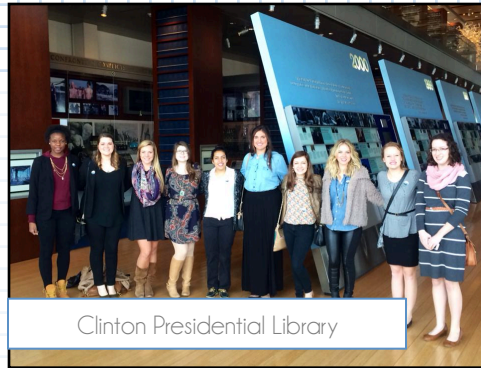
Clinton Presidential Library