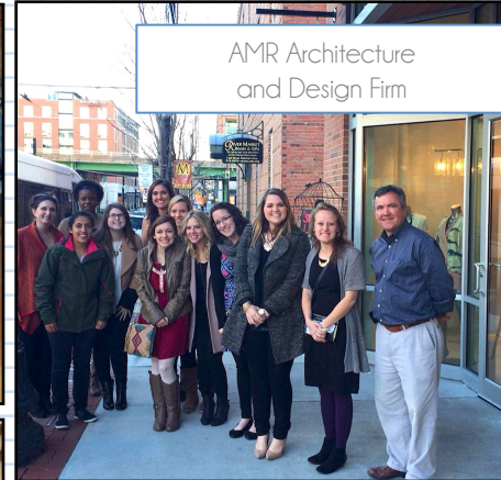
AMR Architecture and Design Firm